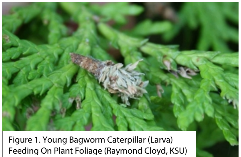
Figure 1. Young Bagworm Caterpillar (Larva) Feeding On Plant Foliage (Raymond Cloyd, KSU)

subsp. kurstaki , is only active on young bagworm caterpillars and must be consumed or ingested to kill bagworm caterpillars. Therefore, thorough coverage of all plant parts and frequent applications are required. The insecticide is sensitive to ultra-violet light degradation and rainfall, which reduces residual activity (persistence). Spinosad is the