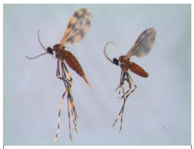
Figure 2. Adult soybean gall midge.

Adults : tiny (2-3mm), delicate flies with an orange abdomen, slender bodies and mottled wings. Long legs are banded with alternating light and dark markings (Figure 2)