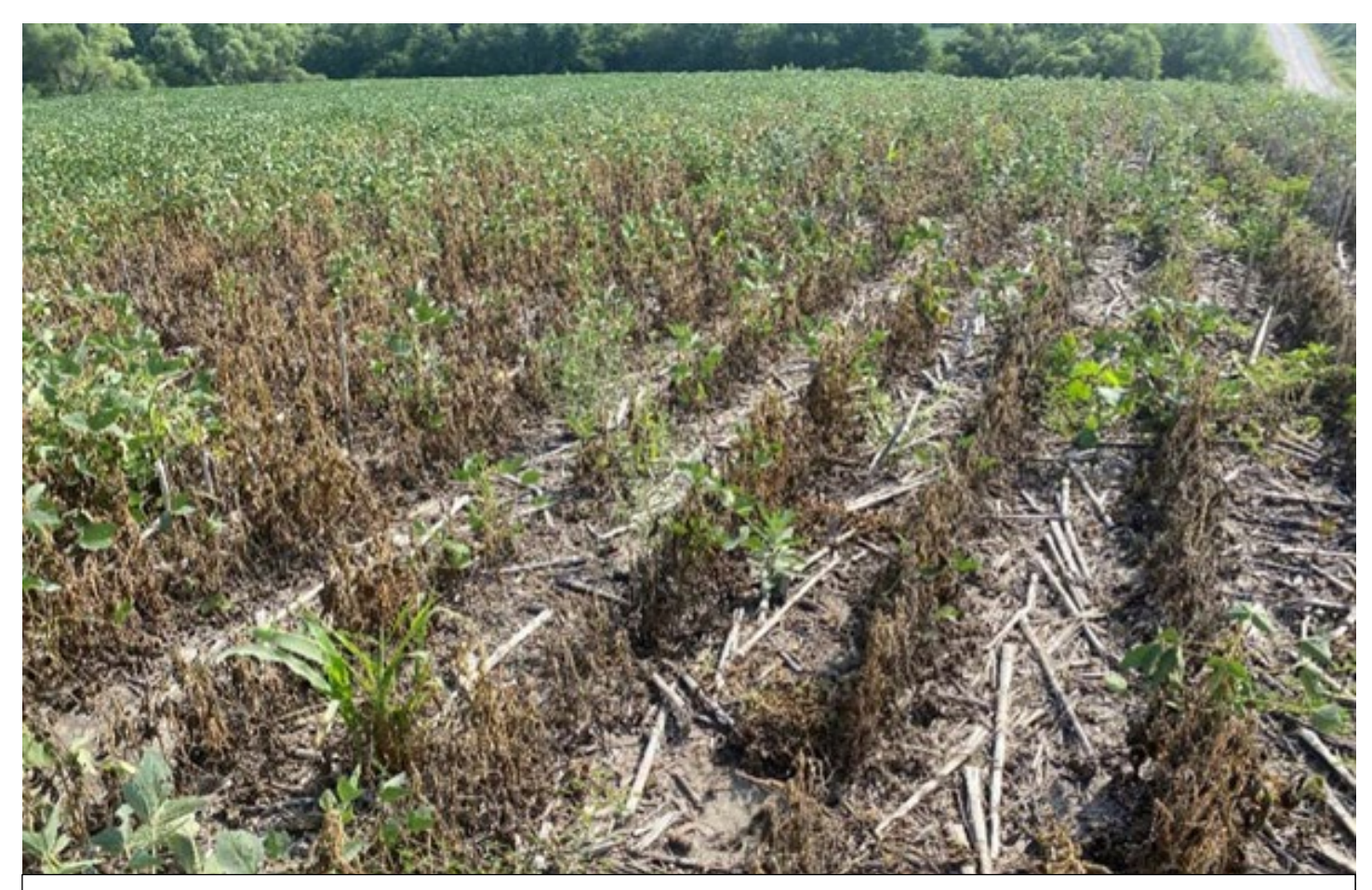
Figure 1. Soybean field with damage by soybean gall midge.

Losses from soybean gall midge infestation are due to plant death and lodging (Figure 1). Heavily infested fields have shown the potential for complete yield losses from the edge of the field up to 100 feet into the field and a 20% yield loss from 200 to 400 feet into the field.