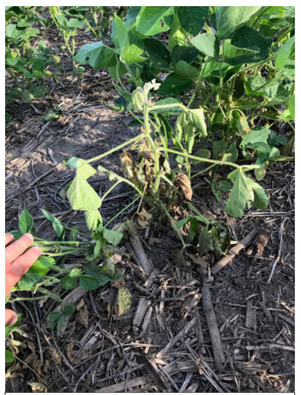
Figure 4. Wilting soybean plant from gall midge infestation. (McMechan)