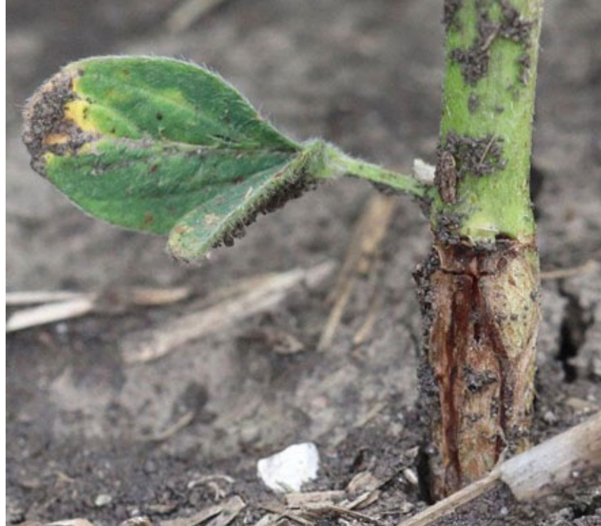
Figure 5. Darkening and swelling of stem.