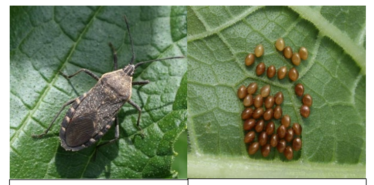
Figure 1. Squash bug adult

Squash bug, Anasa tristis , females are laying eggs and the young nymphs are feeding on squash and pumpkin leaves. Squash bug adults are 1/2 to 3/4 of an inch long. Adults are dark-brown and have wings with brown-to-black and orange markings along the outer edge of the body (Figure 1). Females lay red-orange eggs on the leaf underside (Figure 2) and top of leaves. Nymphs emerge (eclose) from the eggs in seven to 14 days. There are five nymphal instars (stages between each molt) before squash bugs mature into adults. First instar nymphs have a red head and thorax (middle section) and pale-green abdomen (Figure 3). Second instar nymphs have a black head and thorax and a pale-green abdomen (Figure 4). Nymphs gather near the