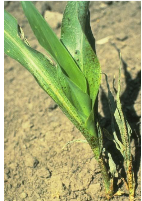
Figure 6. False chinch bug feeding damage to sorghum.

Additional details on life history and management recommendations for these two pests can be found in the following Kansas Crop Pest publications.