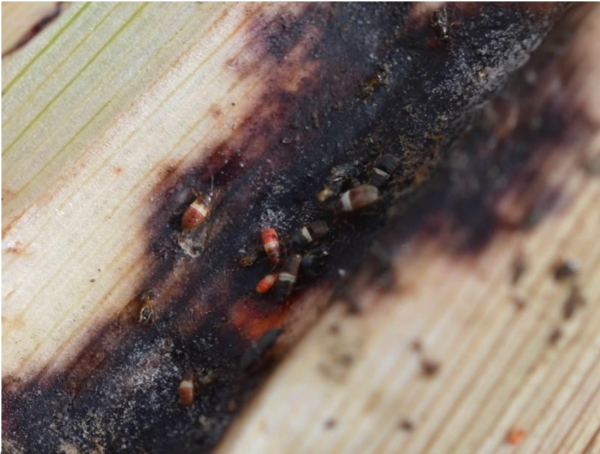
Figure 5. Discoloration caused by chinch bug feeding.

Chinch bugs and false chinch bugs are true bugs in the order Hemiptera which means they both have piercing-sucking mouthparts that they use to puncture plant tissue to feed on plant juices. However, the symptoms of feeding appear differently for these two bugs. When chinch bugs feed, digestive enzymes are injected into the plant tissue causing it to break down and discolor (Figure 5). Reddish spots often are present at chinch bug feeding sites. Heavy chinch bug feeding can also cause stunting, wilting and necrotic lesions on plants. False chinch bug feeding, on the other hand, usually has little effect on plants, but extreme numbers of the bugs on a plant can cause wilting and death (Figure 6).