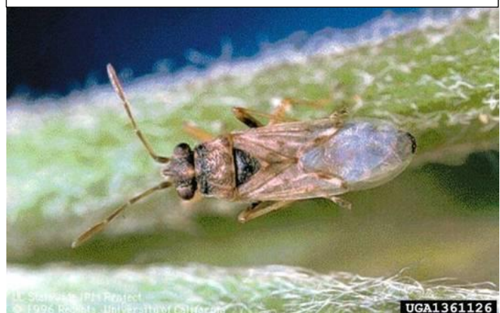
Figure 2. Adult false chinch bug. Note the lack of a dark "X". (KSU Entomology Website)