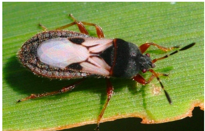
Figure 1. Adult chinch bug.

Adult false chinch bugs are similar in appearance, but smaller. Instead of having black bodies, false chinch bugs are brownish-gray with clear wings that lack a distinct "X" mark (Figure 2).