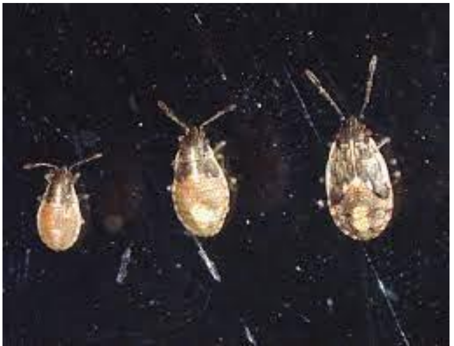
Figure 4. Immature false chinch bugs.

Immature false chinch bugs are grayish-brown, never bright red, and lack the white band across their bodies (Figure 4).