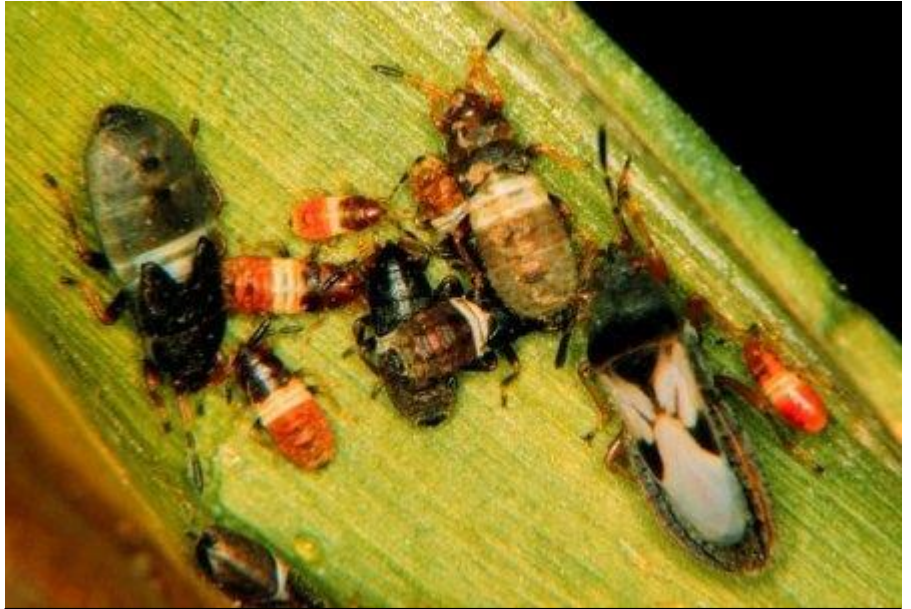
Figure 3. Immature chinch bugs.

Immature chinch bugs are bright red after hatching, darkening to black as they go through a series of 5 molts. A distinct white band will be visible across the nymphs' bodies until the wing buds become large enough to obscure it (Figure 3).